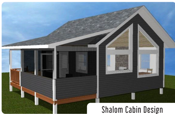
Shalom Cabin Design

Prayer Cabin has been finalized. Our hope is to break ground as soon as we can, once the ground is somewhat dried up. We will