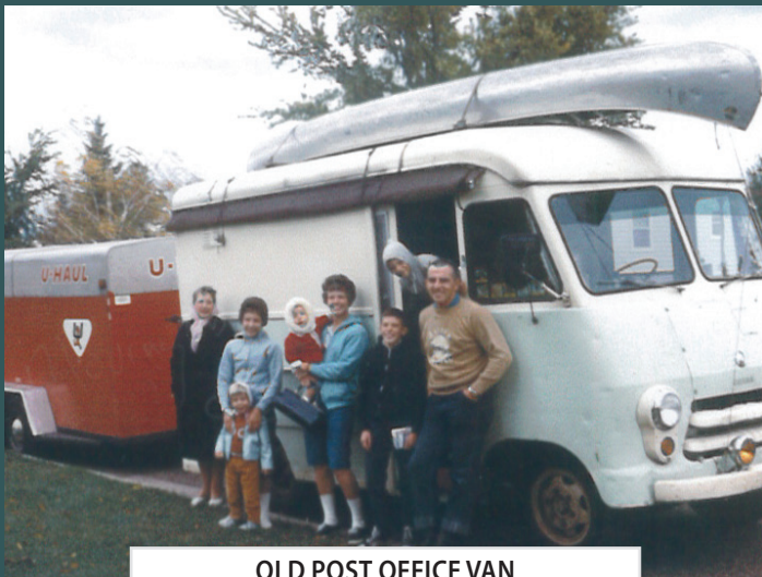
OLD POST OFFICE VAN

were waiting for us? NO! But we were confident that this, another major change for our family of six would be a life changing, impacting experience, never to be forgotten!