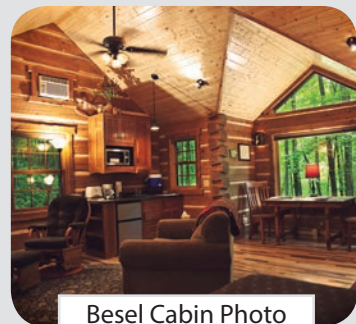
Besel Cabin

"We crossed the threshold of your land and felt our Lord's presence... The scripture waiting for us spoke DIRECTLY to the reason we came. Tears came before I got my coat off in the gorgeous Besel Cabin. We rested, dreamed, healed and soaked in God's presence. This was an immeasurable gift from our Lord!"