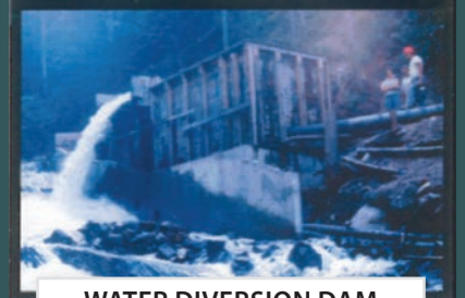
WATER DIVERSION DAM

were waiting for us? NO! But we were confident that this, another major change for our family of six would be a life changing, impacting experience, never to be forgotten!