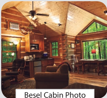
Besel Cabin