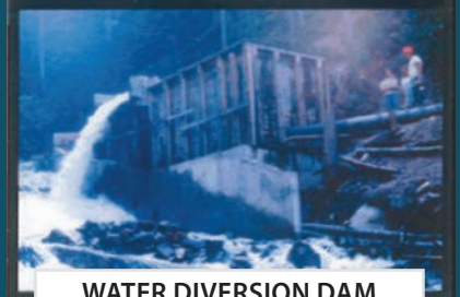
WATER DIVERSION DAM