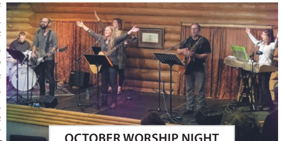
OCTOBER WORSHIP NIGHT