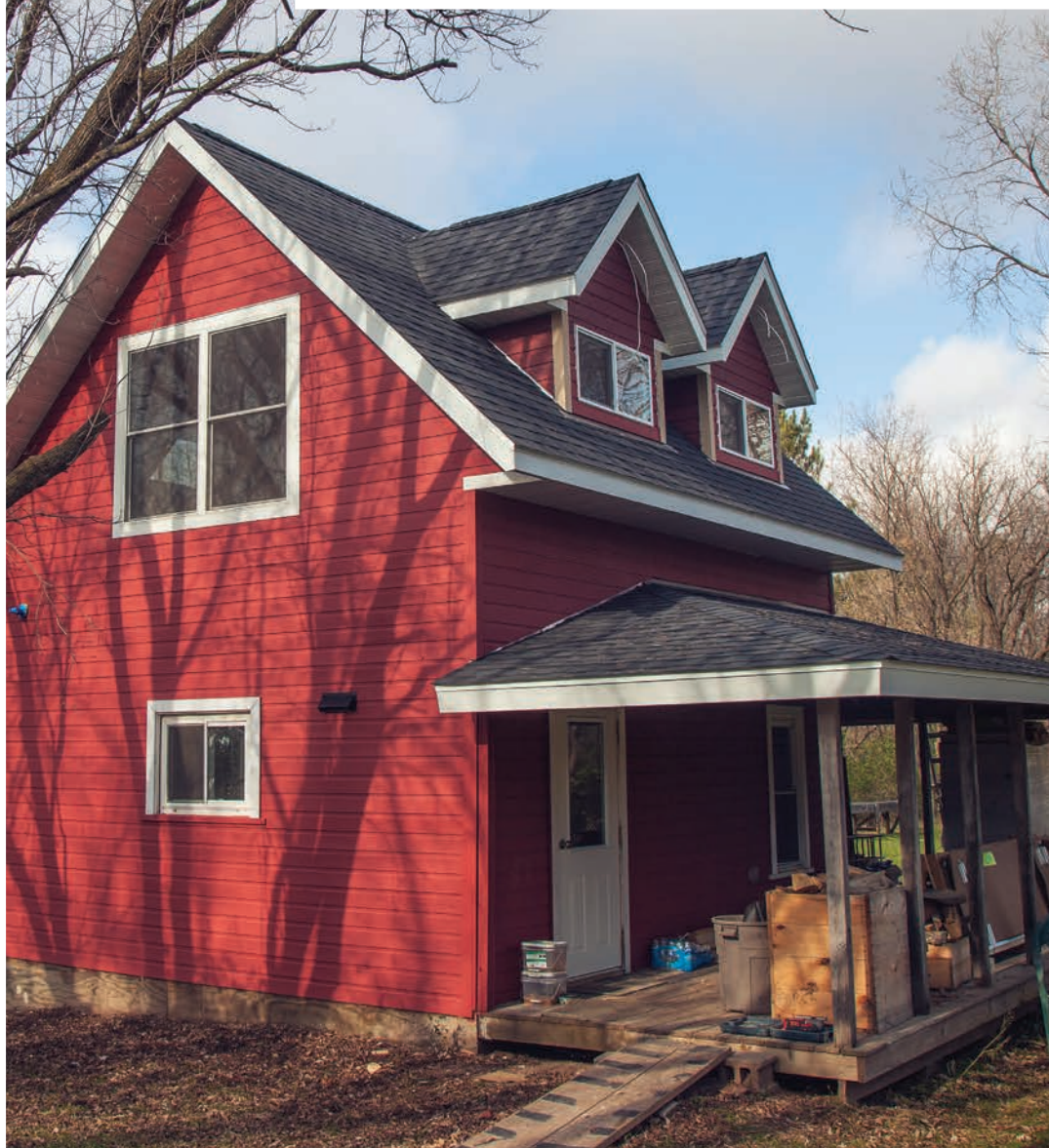
The new and improved Windy Hill Farmhouse! See page 2 for details

"I will take my children into the wilderness and there I will speak tenderly to them. I will restore their fruitfulness and turn their valley of trouble into a door of hope."