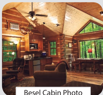
Besel Cabin