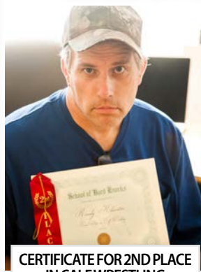
CERTIFICATE FOR 2ND PLACE IN CALF WRESTLING

Midmorning of June 28th I tangled with one of my calves and took 2nd Place! After the calf bolted, my refusal to let it escape, a very painful crash where the 200-lb calf landed on top of me, a trip to the emergency room, CT scans and x-rays, and an overnight stay in the hospital, the results were 4 broken ribs, one being displaced, a bruised lung with a small hole, and lots of pain. The calf is fine!