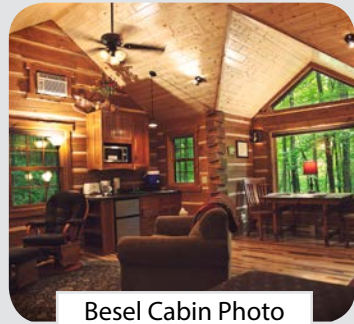
Besel Cabin