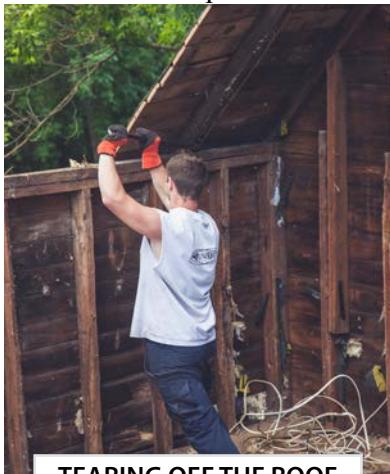
TEARING OFF THE ROOF

Well, slow but sure the Windy Hill Farmhouse is being repaired. The trusses are ordered and completed from K-Wood Truss Rafter. The whole roof of the building has been torn off and now awaits the building contractors to come and start putting it all back together. We are excited about the upgrades that will be seen to this building. Better insulation, better and more windows upstairs, resulting in better cross-ventilation and air flow upstairs and a new roof on the whole thing. Please pray for the builders who will be putting it back together again, that it will go smoothly and quickly. We are anxious to get this building back into service and people are waiting to book it.