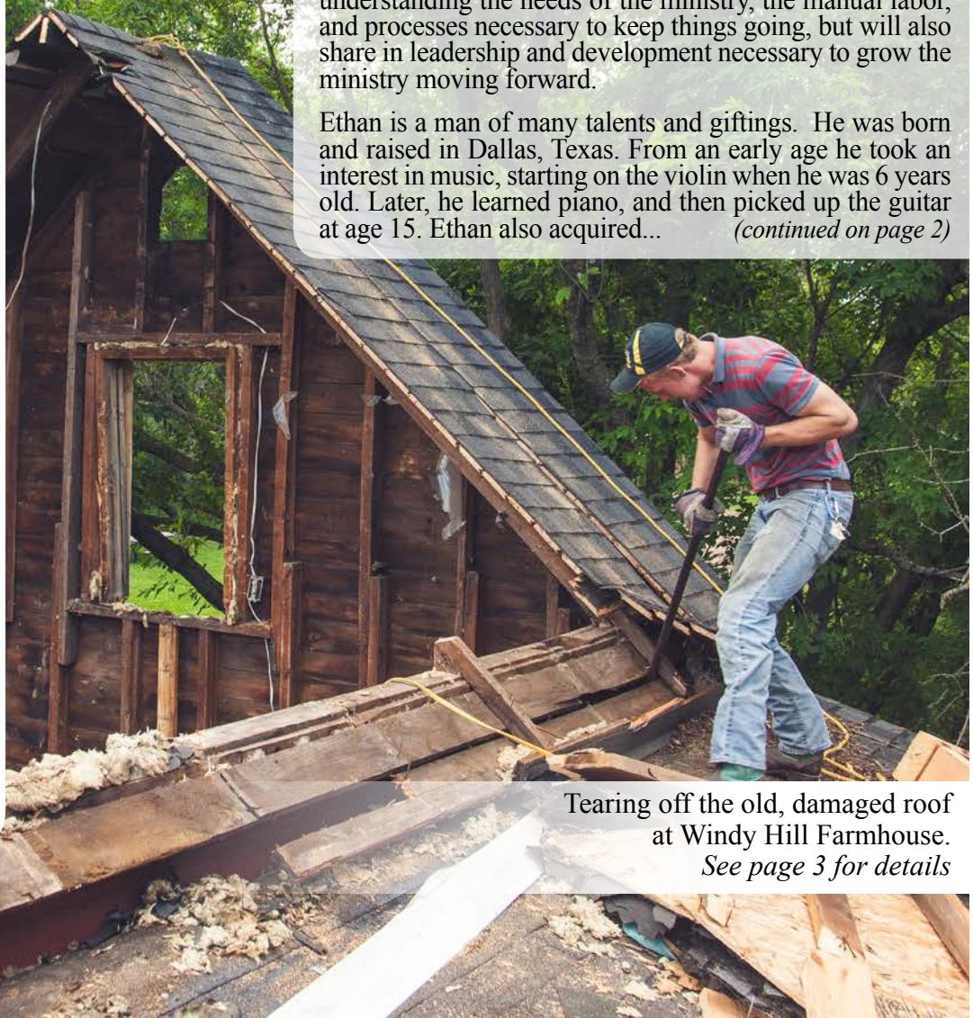
Tearing off the old, damaged roof at Windy Hill Farmhouse. See page 3 for details