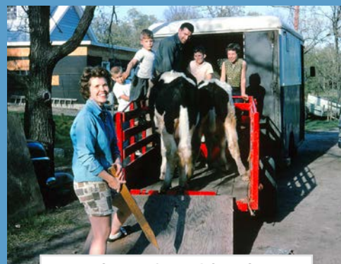
SELLING THE PONIES