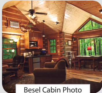
Besel Cabin

"The personal verse left on the table to welcome me in my cabin feels like an answer to a question I have been putting and holding forward before God. It gave me assurance, and I was very comforted to have received it." – ZH