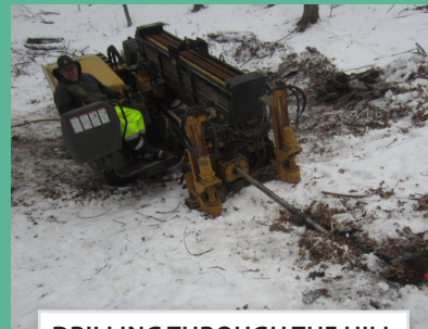
DRILLING THROUGH THE HILL

side of Maple Ridge to tapping, we had to hire a horizontal boring company to drill a hole, 230 feet long, through the ridge, and pull in a 3-inch conduit. We then slipped our lines through that conduit so the sap from the other side of the hill could just run through the hill into our vac hut. Works very well. As of mid-March, we have already collected almost 6000 gallons of sap. The first run of 1500 we sent off to another producer, but we have run the remainder into our cooker and already have 100 gallons of syrup made. If anyone is interested in coming