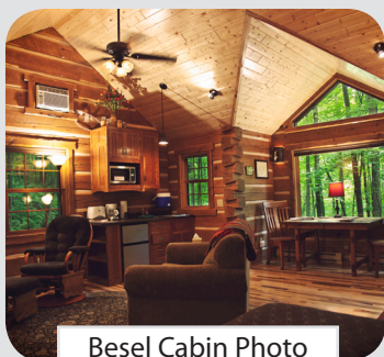
Besel Cabin