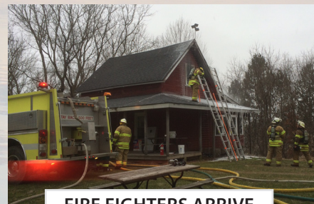
FIRE FIGHTERS ARRIVE

James 1:2 says, “Count it all joy, my brothers, when you meet trials of various kinds, for you know that the testing of your faith produces steadfastness. ... (cont. on page 2)”